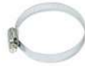
Metal ring (one)

*DIN mount includes four screws to attach it to the back of the device.