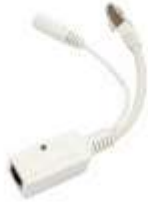
Gigabit PoE injector