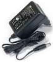
24V 0.8A power adapter