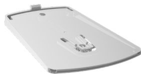
Base leg and pads