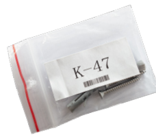
Wall mount set