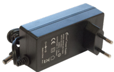
24 V 1.5 A power adapter